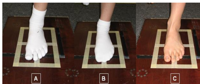
Figure 1: Sock Conditions with single-limb balance tests. A) Five-toed sock condition, B) Regular sock condition, and C) No sock condition.

on a force plate (model 4060NC; Bertec Corp Inc., Columbus, OH) with the subject in a single-limb stance with their hands on their iliac crests, with eyes open (EO) and eyes closed (EC). During the EO trial, subjects were instructed to focus their vision on a large "X" on the wall 3.5 m in front of them and 1.5 m from the floor. The subjects were instructed to keep the non-test limb off the ground in a comfortable position without the limb touching the ground. The test limb was determined as the limb the subject would choose to stand on while kicking a ball. The subjects were instructed to stand as still as possible for 15 seconds. If the subjects hopped on the test limb or touched the ground with the non-test limb, the trial was discarded and repeated. Center of pressure (COP) data were sampled at 50Hz. The subjects completed three 15-second trials with a one-minute rest between trials. Sock conditions were randomized.